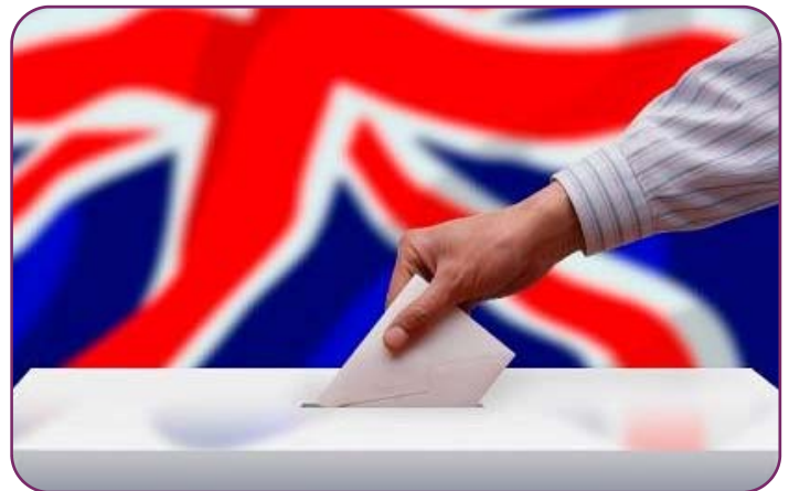
After the election comes the pain of paying for so much borrowing

All investors are affected by the economy and it is therefore revealing that the Chancellor says that the previous government's "golden rule" about borrowing over the economic cycle will be missed by a massive £485bn in the current one. He has, not surprisingly perhaps, abandoned this unreliable measure for the future, preferring instead to rely on the new independent Office for Budget