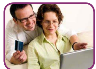
Back Page briefing: Beware online banking